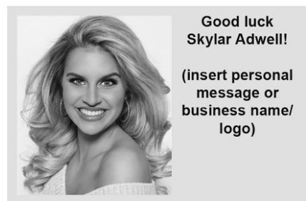
Half Page Ad 8 x 5.125 (1/2" margins)